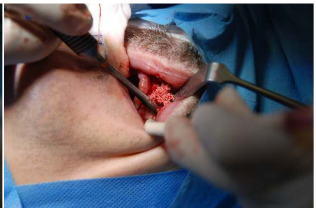
The ELIZ shall fill the cavity for 90%