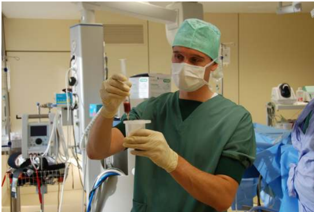
Harvest the stem cells from the bone marrow