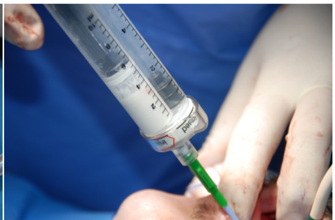
AXOZ is a closed system and shall be mixed for 2 min