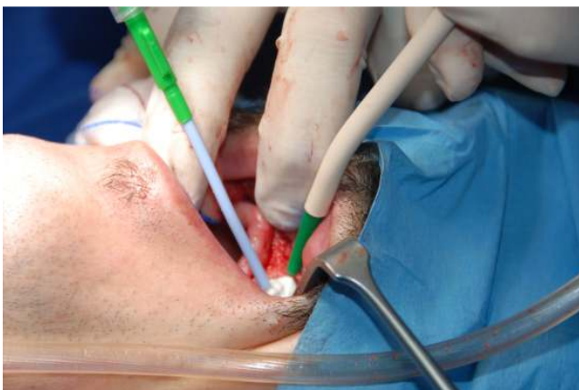
Cover the ELIZ with AXOZ