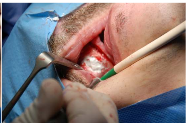
The excessive AXOZ shall be removed