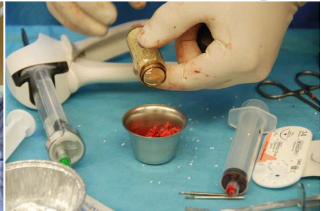
Mix the stem cells with the ELIZ, AXOZ is prepared