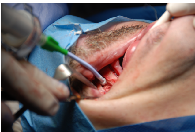
The AXOZ will close the cavity as it hardens in 15 min